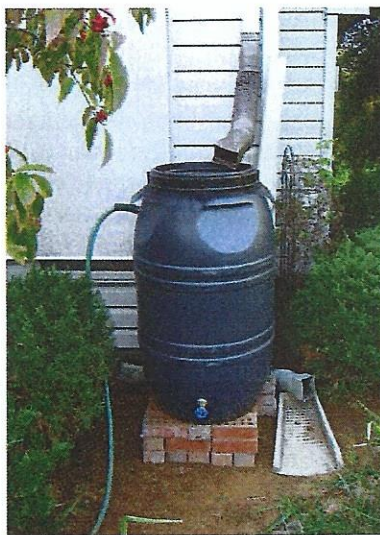
Figure 1. Fifty-five gallon rain barrel made from a recycled olive barrel. A plastic downspout extension is used to direct water into the barrel.

A rain barrel is placed under a gutter's downspout next to a house, small shed or other outdoor structure to collect rain water from the roof. The water can then be used in various ways including to water a garden. A rain barrel provides two important environmental functions: 1) harvesting rain water provides an alternative to utilizing the drinking water supply for gardening and other uses, and 2) the overflow from a rain barrel can be directed to a pervious area (an area where rain water can infiltrate into the ground) such as a lawn or garden and help replenish ground water supplies. By collecting rain water, homeowners help to reduce flooding and pollution in local streams, rivers, and lakes. When rain water runs off of hard surfaces (also called stormwater) like rooftops, roadways, parking lots, and compacted lawns, it carries with it pollution to the storm drain system and is then discharged directly to our rivers and lakes. Often in older cities, the storm drain system is combined with the sanitary system. During large rain events the storm water and raw sewage is discharged directly to local waterways. Harvesting rain water in a rain barrel reduces the potential for stormwater to deliver pollution to our local waterways.