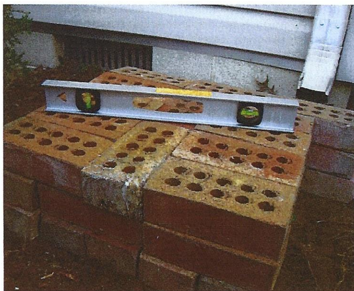
Figure 2. Brick platform used to elevate a rain barrel. The ground below the platform should be leveled out before installing a rain barrel.

Installing a rain barrel under a downspout is simple but does require some planning. Determine beforehand where the overflow from your barrel will be directed. Consider how the downspout runoff conditions will change when you install your barrel. For example, many downspouts are directed below ground through a stand-pipe, and the roof runoff is discharged to some distant runoff area such as the street. If installing a rain barrel in this situation, determine beforehand whether the overflow will go back into the standpipe or whether you can safely divert the water to a landscaped area and allow some to soak into the ground. Ideally the overflow should be directed to a pervious area where the water can infiltrate into the ground, such as a garden, mulched planting bed, or lawn. This is not always possible especially in more urban, highly developed areas. When it is possible to direct the overflow to a pervious area, overflow should be directed at least six (6) feet from the house or building foundation if there is a basement and at least two (2) feet if there is a crawl space.