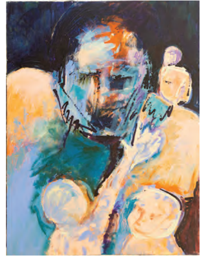
"The Beckoning" by Rita Herzfeld Acrylic on Canvas 48" H x 36" W 2022

porcelain tea cup. For this juried exhibition 32 artists provide a wide range of media and interpretations as to what is fragile in reference to any person, place, object or existing circumstance.