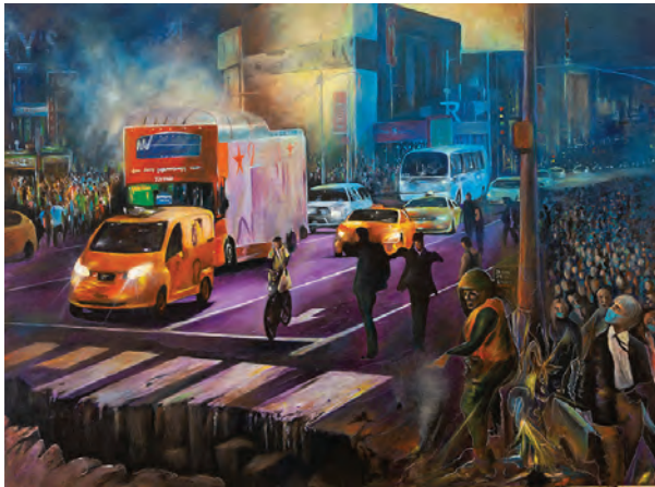
"Precipice" by Edward Jean Baptiste Acrylic on Canvas 48" W x 36" H 2022

Hamilton Street Gallery welcomes the Spring season with an exhibition entitled "fragile". As we continually persevere through the devastation of the Covid 19 pandemic, many of us have developed an increased awareness of our mortality as well as the fragility of everything around us, including the people, places, and things we cherish. Even when handled with the utmost care, they are just as susceptible to the cracks, breaks and destruction as a