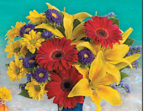
Summer Daydream Vase TEV31-4B