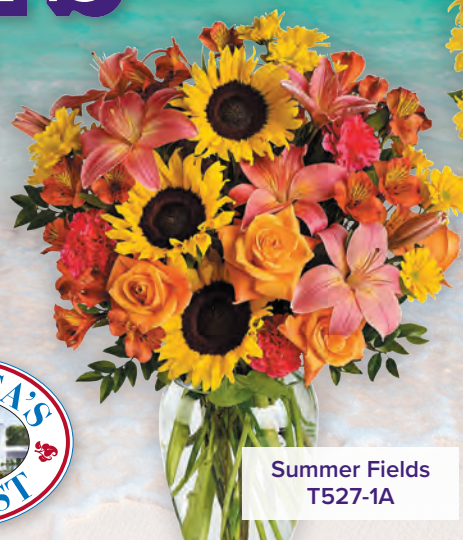
Summer Fields T527-1A